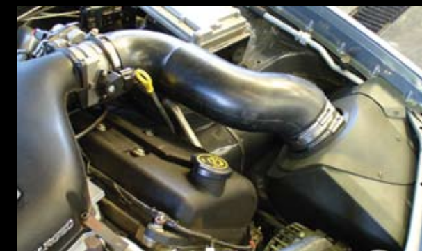
YellaTerra Cold Air Induction Kits