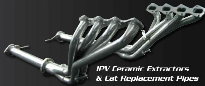
IPV Ceramic Extractors & Cat Replacement Pipes