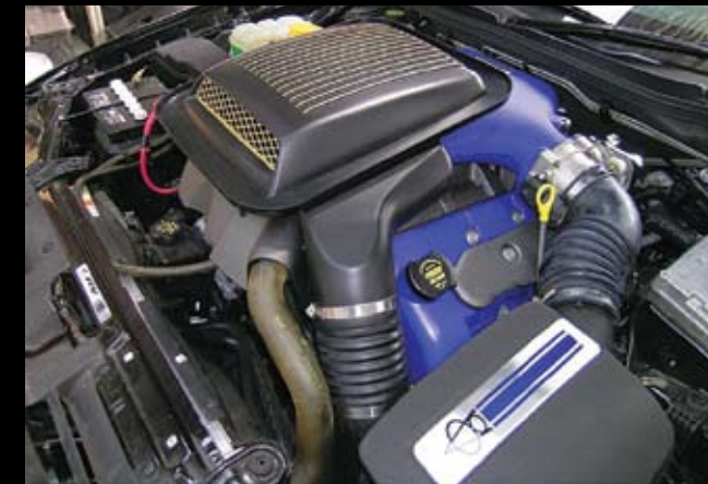
Performance Shaker Kits