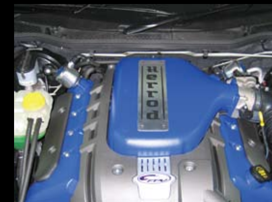
Herrod Engine Accessories